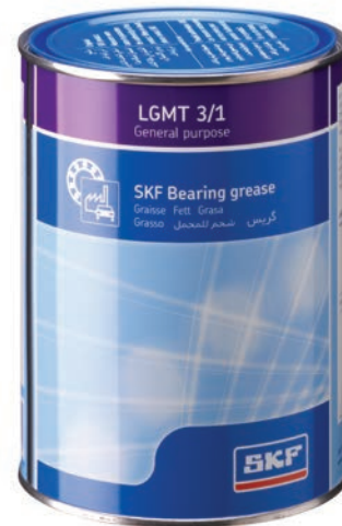
Genuine SKF LGMT 3 Grease Can

Low viscosity of the fake grease (below the required value of 110 mm 2 /s) means a low wear protection causing early bearing failure and consequently increasing a risk of road accident.